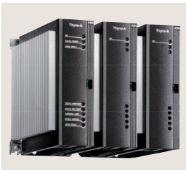
Thyro-A 3A H1 / H RL1 / H RLP1 THREE PHASE POWER CONTROLLER