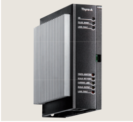
Thyro-A 1A H1 / H RL1 / H RLP1 SINGLE PHASE POWER CONTROLLER