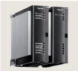
Thyro-A 2A H1 / H RL1 / H RLP1 DUAL PHASE POWER CONTROLLER FOR THREE PHASE LOADS WITH THREE PHASE CIRCUIT